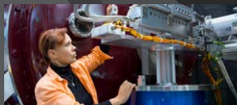
Bilby Time-of-Flight Small-Angle Neutron Scattering