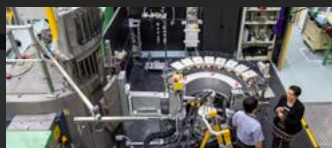
Wombat High-Intensity Powder Diffractometer

Just some of the instruments at ANSTO's Australian Centre for Neutron Scattering (ACNS)