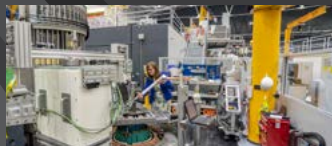
Kowari Strain Scanner