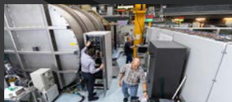
Platypus Neutron Reflectometer